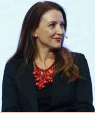
REGINA DE DOMINICIS UNICEF REPRESENTATIVE TO TÜRKİYE

“The 600 million adolescent girls living in our world today are ready to become the largest generation of women leaders ever seen in history. This is possible with one condition only: We should equip them with the right opportunities and skills. On this ‘Day of the Girl’, we invite governments, stakeholders, communities, and parents to believe in adolescent girls and remove the barriers in front of them, to allow them to flourish and contribute to their communities.”